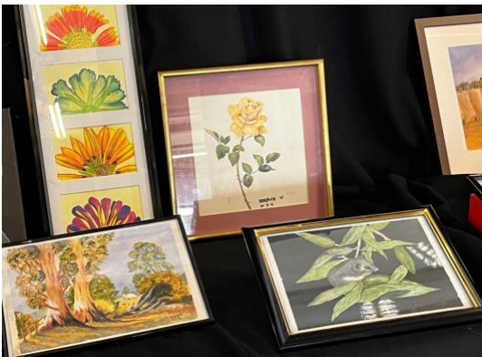
A portion of the Art display.

Our Tuesday, Wednesday and Friday art classes supplied a total of 78 pictures to display in the studio room at the Clocktower. We were able to mount a very impressive display of U3A art. Thanks must go to the artists for entrusting their work to us.